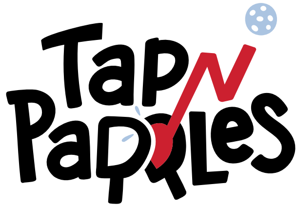
Primary Logo Full Color