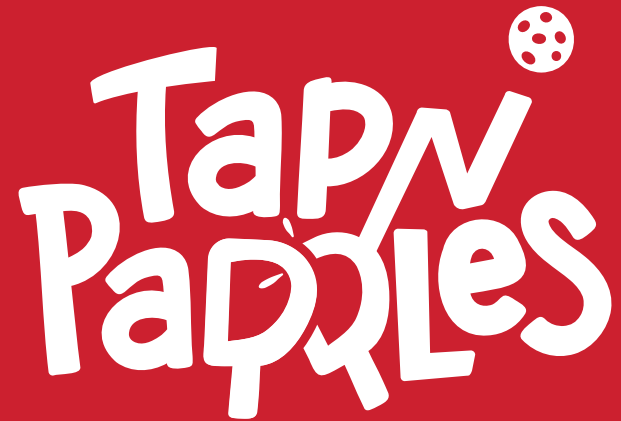
Primary Logo One Color